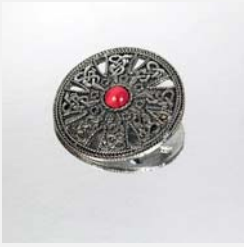
Lead Free Pewter Celtic Serpent Brooch with Ruby Moonstone ASWPB04