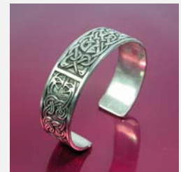
Viking Pictish Solid Pewter adjustable bracelet. Designs from the symbol stone at Rosemarkie. AVB002