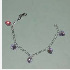
5 Vitriol Swarovski Crystal hearts on Sterling Silver 7.5" Bracelet. Hearts 10 x 10mm. ASUBS620210VL