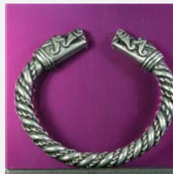
Viking Dragon Head Solid Pewter Bracelet the adjustable bracelet features 2 dragon heads & a finely detailed body ASVB001