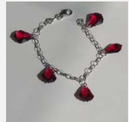
5 Ruby Swarovski Crystal Baroque on Sterling Silver 7.5" Bracelet. Baroque 16 x 16mm. ASUBS609016RU