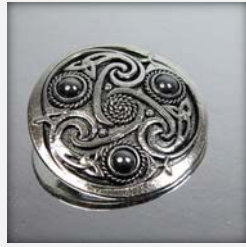
Lead Free Pewter Celtic Brooch Trisquele Design with 3 Hematite Moonstones ASWPB06