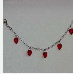
5 Siam Red Swarovski Crystal hearts on Sterling Silver 7.5" Bracelet. Hearts 10 x 10mm. ASUBS620210SI