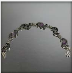
Celtic Design Lead Free Pewter Bracelet with Amethyst Moonstones. Made in Wales. ASWBR22