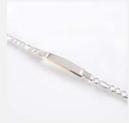
Sterling Silver ID Bracelet Figaro Chain Fits wrists 6.5" with Lobster Clasp Weight: 5.3g ASSBLFGID