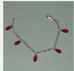
5 Siam Red Swarovski Crystal Briolette on Sterling Silver 7.5" Bracelet. Crystal 10 x 10mm. ASUBS601010SI