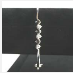
Striking silver hinged bangle bracelet with black & diamond white cubic zirconia fits 6.5" - 7.25" wrist. ASSBNCZBW