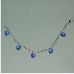
5 Sapphire Swarovski Crystal hearts on Sterling Silver 7.5" Bracelet. Hearts 10 x 10mm. ASUBS620210LS