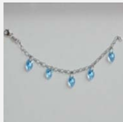
5 Aqua Swarovski Crystal hearts on Sterling Silver 7.5" Bracelet. Hearts 10 x 10mm. ASUBS620210AQ