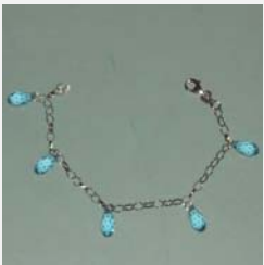
5 Aqua Swarovski Crystal Briolette on Sterling Silver 7.5" Bracelet. Briolette 10 x 10mm. ASUBS601010AQ