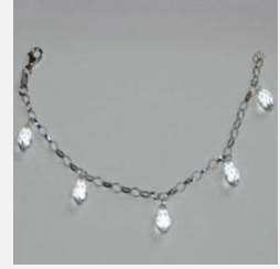
5 Clear Swarovski Crystal Briolette on Sterling Silver 7.5" Bracelet. Briolette 10 x 10mm. ASUBS601010