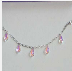
5 Aurora Borealis Swarovski Crystal Baroque on Sterling Silver 7.5" Bracelet. Baroque 10 x 10mm. ASUBS609016AB