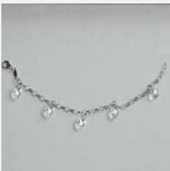
5 Clear Swarovski Crystal hearts on Sterling Silver 7.5" Bracelet. Hearts 10 x 10mm. ASUBS620210