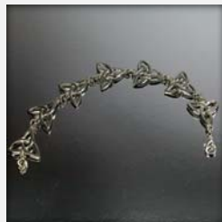
Celtic Triquetras Lead Free Pewter 18cm Bracelet seven Celtic triquetras in our pewter bracelet ASWBR38