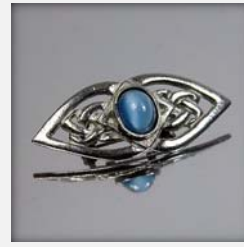
Lead Free Pewter Celtic Brooch Celtic Double Knot Pewter Brooch with Blue Moonstone ASWPB14