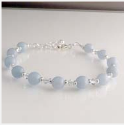
STS Angelite and Swarovski 7 - 8.5" Bracelet 11g weight ASSBASW