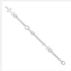
Sterling Silver Love Spoon Charm Bracelet Made in England 7.5" long Width 7mm Carbineer Clasp: ASSBCFBL5