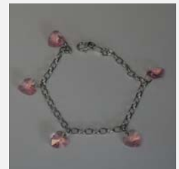
5 Rose Swarovski Crystal hearts on Sterling Silver 7.5" Bracelet. Hearts 10 x 10mm. ASUBS620210LR