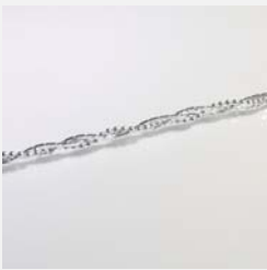
Sterling Silver Lightweight Twisted Chain Bracelet Fits slender 6" wrist & Lobster Clasp. ASSBTBC