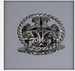
Lead Free Pewter Celtic Brooch Celtic Swirls Pewter Brooch ASWPB14

If you see any item here that you may like just email the item code at the end of each description to the address below and I will answer you ASAP