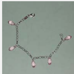
5 Rose Swarovski Crystal Briolette on Sterling Silver 7.5" Bracelet. Briolette 10 x 10mm. ASUBS601010LR