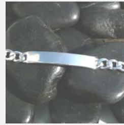
Sterling Silver Men's I.D. figaro chain Bracelet with lobster claw catch and a blank engraving plate Weighs 17g. ASMBRIDFIG