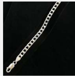
Sterling Silver Square Curb Gents Bracelet Fits wrists 7.75" length 204mm Width: 5mm ASSMBSQFC