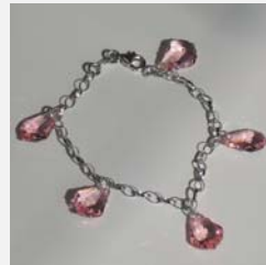
5 Rose Swarovski Crystal Baroque on Sterling Silver 7.5" Bracelet. Baroque 16 x 16mm. ASUBS609016LS