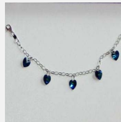
5 Bermuda Blue Swarovski Crystal hearts on Sterling Silver 7.5" Bracelet. Hearts 10 x 10mm. ASUBS620210BB