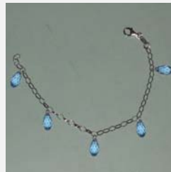
5 Sapphire Swarovski Crystal Briolette on Sterling Silver 7.5" Bracelet. Briolette 10 x 10mm. ASUBS601010LS