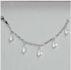
5 Clear Swarovski Crystal Baroque on Sterling Silver 7.5" Bracelet. Baroque 16 x 16mm. ASUBS609016